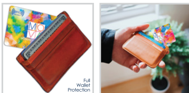
Full Wallet Protection