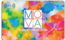
Back Imprint Double-sided Decoration